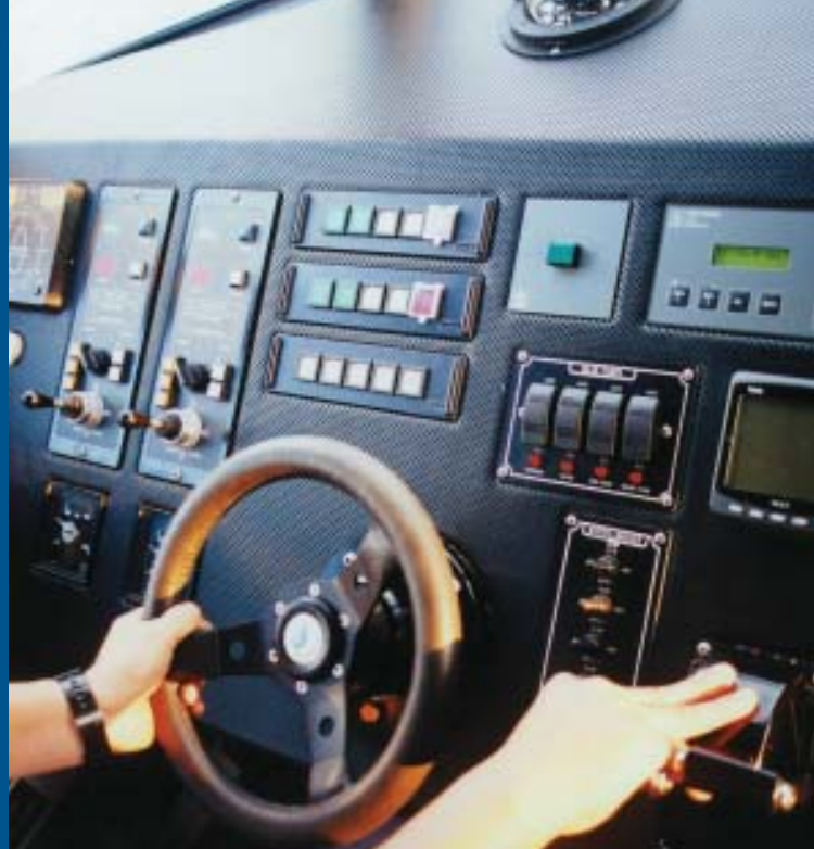
Typical MECS helm station.

In addition to the electronic modules, a complete system includes a jet mounted and driven hydraulic power unit (JHPU) on each jet, inboard hydraulic steering and reverse actuators and feedback units, engine and gearbox interfaces (or actuators) and other interfacing and sensing options.