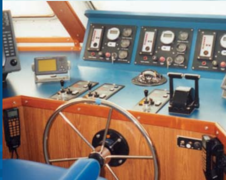
Hand-held remote for "walk-about" manoeuvring control